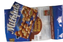
Candy & chip wrappers