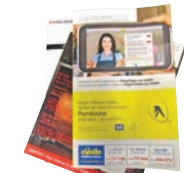
Magazines, catalogues & phone books (remove plastic)