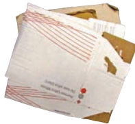
Cardboard (2 ft x 3ft (0.61 x 0.91 m), flattened and/or bundled)