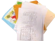
Paper (colored & white) & file folders