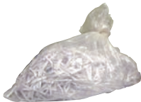
Shredded paper (in a clear plastic bag)