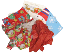
Wrapping (non-metallic)/tissue paper & greeting cards