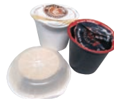
Coffee pods (K-Cups, Tassimo T-discs)