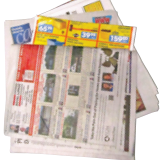
Newspapers & flyers (including glossy)