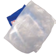
Cereal/cracker box liners & cookie bags