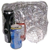
Aluminum cans & plates

Return all eligible liquor, wine, beer containers to the Beer Store for a refund.