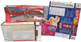
Cereal, tissue, frozen food, cracker boxes