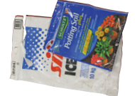
Plastic wood pellet, salt & sand bags (empty)