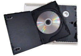
CD/VHS/DVDs & cases