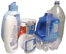
Plastic bottles, jugs, tubs & lids (Empty liquids)