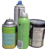
Aerosol (empty) & tin cans