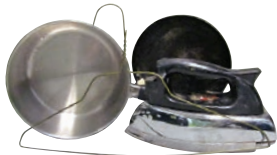
Small scrap metal items - Must fit in your yellow bin - baking sheets, small appliances (i.e. toaster, metal tools, etc., remove & discard cords in garbage, remove batteries for hazardous waste)