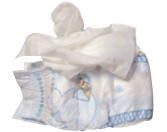
Diapers & diaper wipes